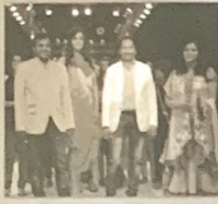
Fashion Show LFW