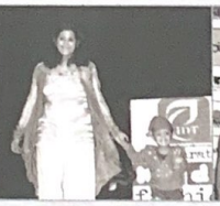
GKF - 2015