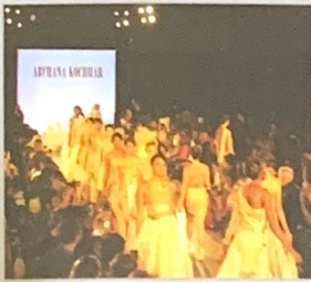
NYFW-2015 Make In India Campaign