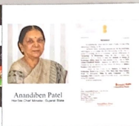
Anandiben Patel Hon'ble Chair Minister, Gujarat State