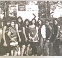
Student Participation Lakme Fashion Week