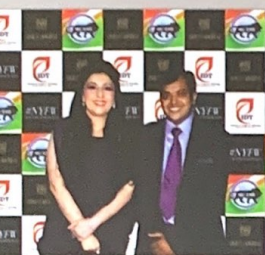
NYFW-2015 Make In India Campaign